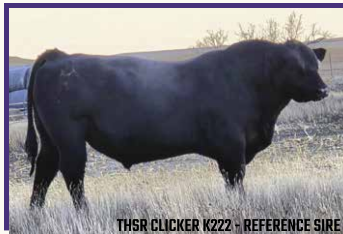
THSR CLICKER K222 - REFERENCE SIRE

Here is another Clicker with a light 80 lb. birth wt, out of a 2 year old Falcon daughter. He's got the right parts to sire value both in his feeder calves, and his daughters. There is excellent udder quality in his cow family.