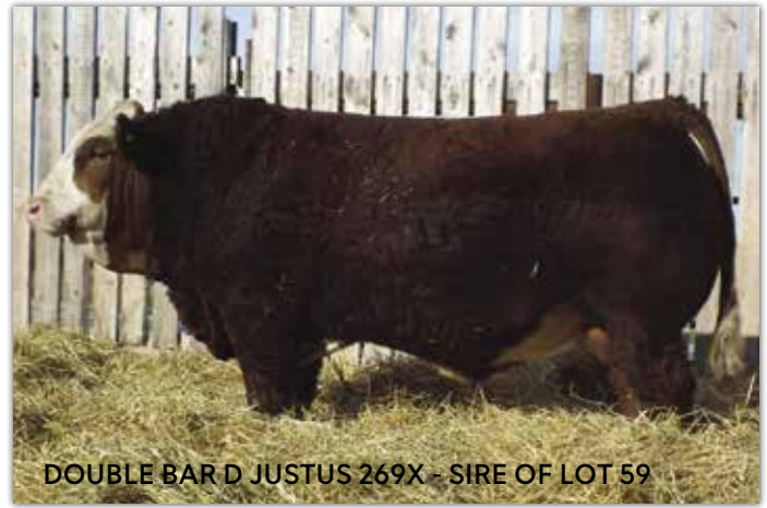
DOUBLE BAR D JUSTUS 269X - SIRE OF LOT 59

Polled, Solid Black, 3/4 SM 1/4 AN, Embryo Transfer. A full brother to Lot 19 but different recip of course. Born in the bitter cold and yet survived. Dam's production 7 @ 104, Grand dam's production 9 @ 102. NEOGEN GGP.