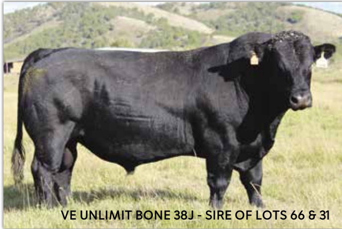
VE UNLIMIT BONE 38J - SIRE OF LOTS 66 & 31

Polled, Black Snip, 1/2 SM 1/2 AN. Total outcross pedigree to be used most anywhere. Dam is moderate and fancy uddered just the way that cow family makes them. Dam's production 2 @ 97, Grand dam's production 3 @ 103. NEOGEN GGP.