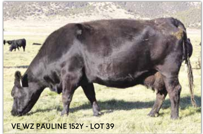
VE WZ PAULINE 152Y - LOT 39

Polled, Black Brockle, 1/2 SM 1/2 AN. Great feet, udders, and fertility run deep in this pedigree. A very nice heifer bull candidate. Dam's production 11 @ 101, Grand dam's production 9 @ 106. NEOGEN GGP.