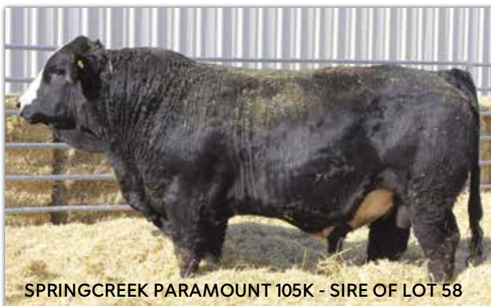
SPRINGCREEK PARAMOUNT 105K - SIRE OF LOT 58

Horned, Black Star, 5/8 SM 3/8 AN. His dam stood the test of time here and was culled by choice due to age but was pregnant. RSVP sired fabulous cows across the US. Dam's production 8 @ 99.