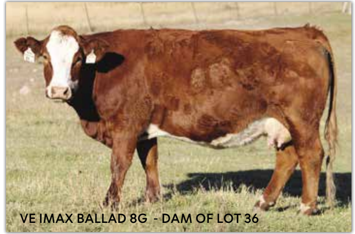
VE IMAX BALLAD 8G - DAM OF LOT 36

Polled, Black Blaze, 3/4 SM 1/4 AN. A bit younger but packing some heat. Another "8 Ball" that could go anywhere sight unseen and the new owner will be pleased. Dam's production 3 @ 103, Grand dam's production 8 @ 108. NEOGEN GGP.