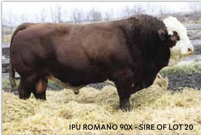
IPU ROMANO 90X - SIRE OF LOT 20

Polled, Black Blaze, 3/4 SM 1/4 AN, Embryo Transfer. WOWZA! Grunt, style, thick hipped rascal built on a stout leg. Highly recommended! Dam's production 7 @ 104, Grand dam's production 9 @ 102. NEOGEN GGP.