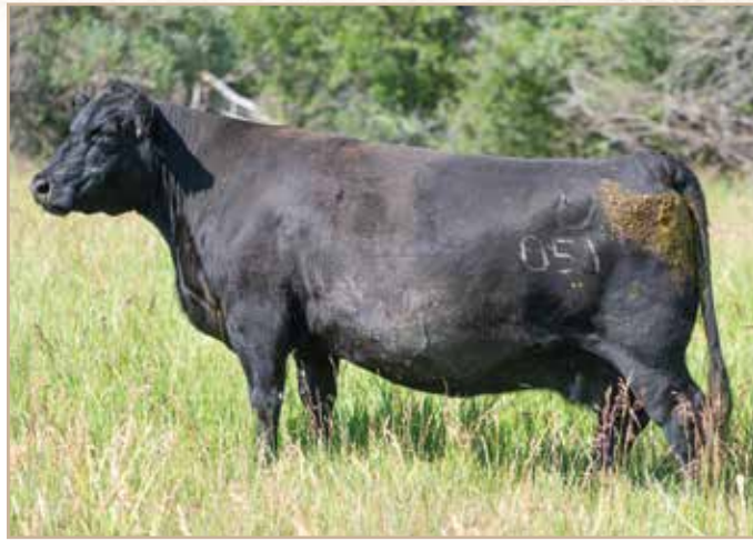
DAM OF LOT 19

Might be as high quality of a bull as there is in the offering! This one is outstanding and does so many things to an incredibly high level! He's masculine and rugged without sacrificing style, eye appeal and balance from the side. He flows and transitions so well, having the right kind of rib and muscle pattern while offering a tremendous bold shape with added width and dimension. Definitely one of the sounder structured, better built bulls in the offering that is awesome in the way his shoulder is constructed with added the length of hip and flex in his hock. So high quality, he is a must set! Safe to use on heifers.