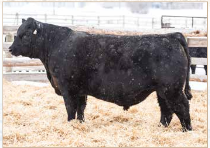
FULL BROTHER TO LOT 90

Really neat individual with some cool pieces! Like the way his neck attaches into his shoulder, the strength and width down his top being level hiped and set right in his tail. Tag 90 is really impressive in his rib shape and muscle pattern so this bull is easy to like on the profile.