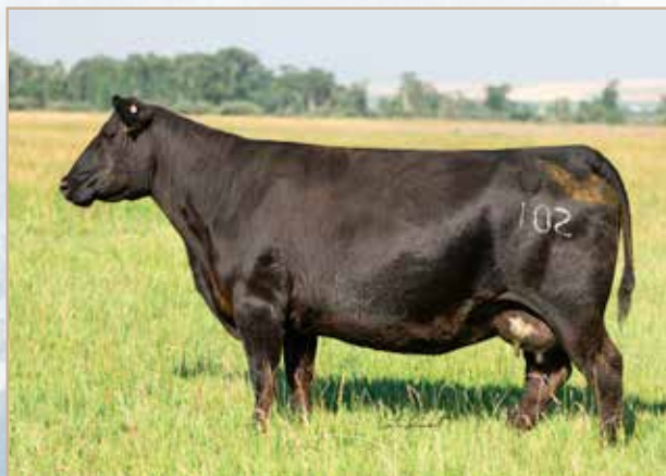
DAM OF LOT 25