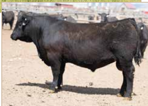
MATERNAL BROTHER TO LOT 80 - 2020 HIGH SELLER TO HINMAN ANGUS