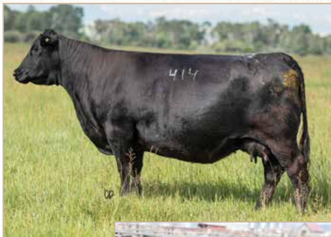
DAM OF LOT 80