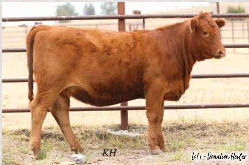
Donation Open Heifer