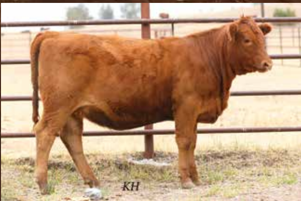
DONATION HEIFER - ANGELO KIMA 2016