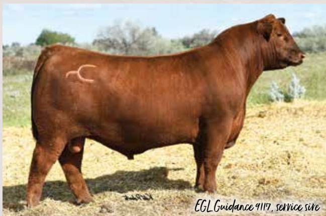
EGL Guidance 9117, service sire

Bred to Six Mile Private Stock 32H (#4420165) on 4/3/22. Pasture exposed from 4/4/22-5/15/22 to C-Bar Collusion 244J (#4534635). Confirmed for a 1/15/23 calf.