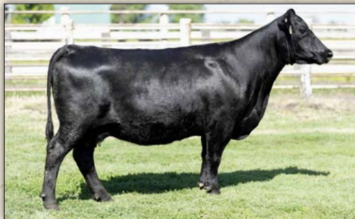
Meadow Acres Erica 2248 7200