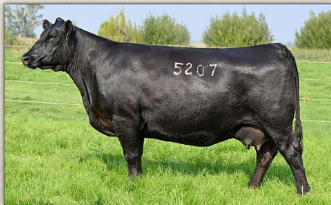
Coleman Donna 5207 - Dam of Lots 1 and 2