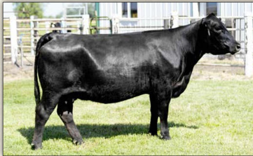
Meadow Acres 0235