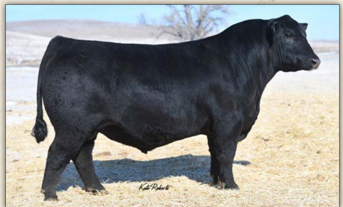
Sitz Resilient 10208