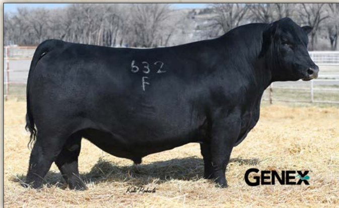
Sitz Barricade 632F