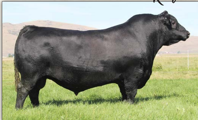
Coleman Bravo 6313