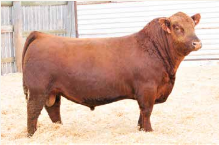
JACOBSON MECHANIC 9118, SIRE

Ridge RAD 9075 has been used extensively both AI and natural in our herd. He was primarily a calving ease bull but we bred him to some performance cows this year and found he can sire performance cattle as well. If you need some performance in your steers but still need good dispositions and excellent udders, he will get it done. 6 sons sell.