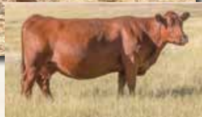
HRR BLOCKANA 566, DAM