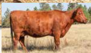
HRR LAKOTA 136, DAM