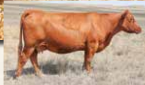
MLK CRK LAKOTA 2115, DAM