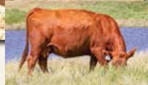
HRR EILEEN 005, DAM