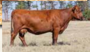
HRR SALLEE 021, DAM