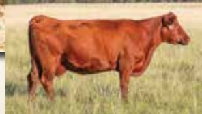
HRR MONA 978, DAM