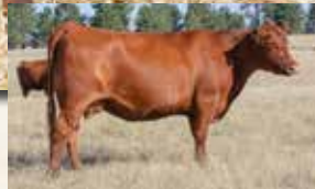
HRR LAKOTA 844, DAM