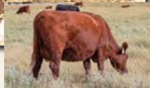
HRR LAKOTA 003, DAM