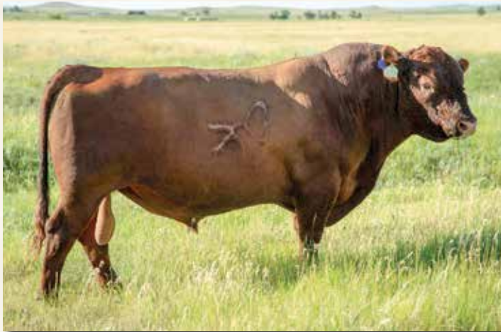
HRR EXPRESS 5142

HRR Franchise 8211 was a home raised bull that we used lightly but have really been pleased with the daughters and bull calves. We collected semen before his untimely passing and will be using him heavier in the future. He has a great set of indices to go with the consistent phenotype he passes on to his offspring. 1 son sells.