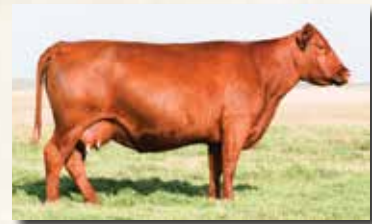
HRR LAKOTA 699, DAM

HRR Franchise 4256 is a HRR Franchise 8211 son that checks the boxes in a lot categories. He is dark red, smooth made and very attractive with EPD rankings in the top end across the board. This is the fourth sale bull in a row that his dam, HRR Blockana 741 has raised that has made it to the sale. She posts a 102 MPPA. A definite herd sire prospect.