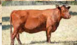
HRR FREYJA 547, DAM