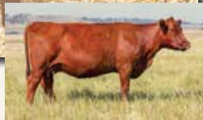
HRR INATEXXI 901, DAM