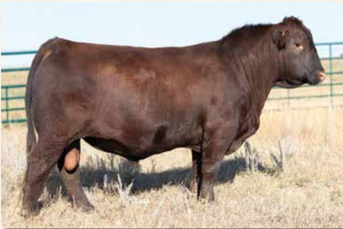
DAHLKE ROCKEFELLER 009H

Body Builder and several sons in our herd to capture the value that they bring to the business of making cows. 6 sons sell.