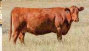
HRR FIREFLY 906, DAM