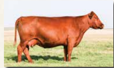
HRR LAKOTA 699, MGD

5L BLOCKADE 2218-30B 5L BODY BUILDER 4434-68D 5L RED BIRD 411-4434