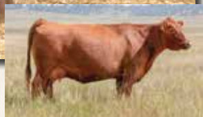
HRR BLOCKANA 838, DAM