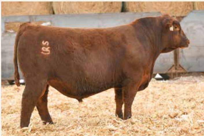
RIDGE NAVIGATOR 0039

Jacobson Mechanic 1033 was an active sire used naturally that combined calving ease with an excellent Gridmaster index. He sired a very consistent set of calves. His dam stems from 5L BOURNE 117-48A and the Infamous Forster Copper Queen cow family. 6 sons sell.