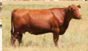
HRR RACHEL 736, DAM