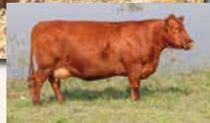
HRR BLOCKANA 013, MGD

HRR Rockefeller 4211 is a high performance son of Ridge RAD 9075 out of HRR Blockana 264 who is a daughter of HRR Blockana 013, a top donor cow. This two year old dam did a great job for her first try and will be selling as lot 64.