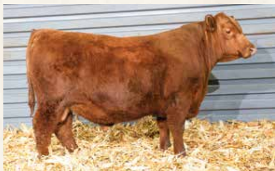
NATURAL SERVICE SIRE: HRR BODY BUILDER 2401 (#4637193)