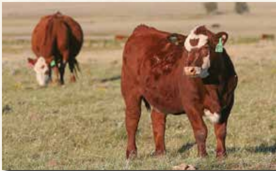
HRR COMMERCIAL HEIFER