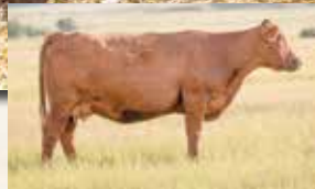
HRR MEG 8107, DAM