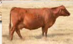
HRR FIREFLY 240, MGD