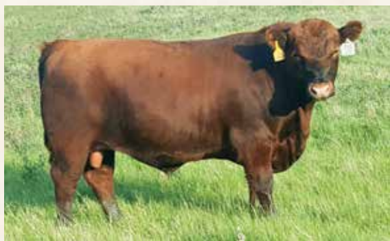
AI SIRE: RIDGE RAD 9075 (#4132976)