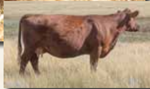
HRR BLOCKANA 609, DAM