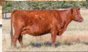
HRR MONA 9175, DAM