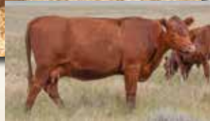
HRR LAKOTA 018, MGD