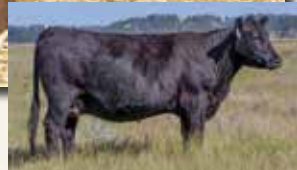
HRR PAULA 050, DAM