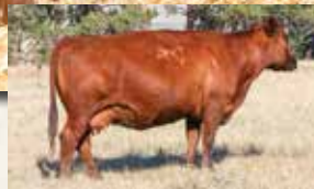
HRR BLOCKANA 807, DAM