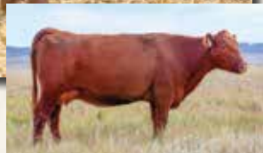
HRR BLOCKANA 949, MGD