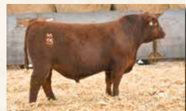
RIDGE NAVIGATOR 0039, SIRE

HRR Navigator 4236 is a light birthweight Ridge Navigator 0039 son from a 10 year old dam, HRR Estonia 589 who posts a 103 MPPA. Nicely balanced performance on this spread bull. Five out of the last 7 bull calves of his dam have been in the sale. This is a really complete herd bull with longevity on both sides of his pedigree. The Ridge Navigator 0039 daughters in production are really nice uddered and making really good cows. Navigator was lost a couple winters ago so we only have semen to carry on his line. Don't miss this opportunity.