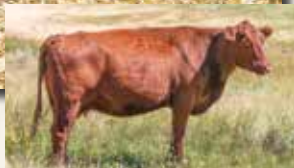
HRR ESTONIA 9133, DAM