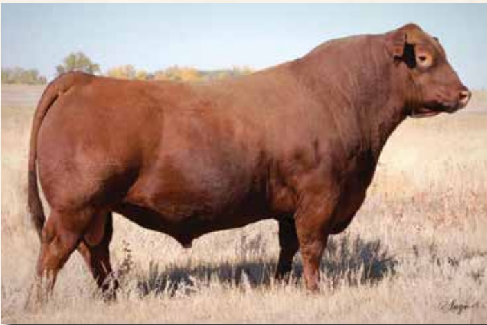
RED U-2 AUTHENTIC 139A, SIRE TO LOTS 64 & 64

HRR Blockkana 232 is a full sister to the HRR Blockkana 264. She weaned off an above average bull calf with a lighter birthweight than her sister. The RED U-2 Authentic139A daughters have good feet and udders.