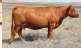
MLK CRK LAKOTA 2115, DAM