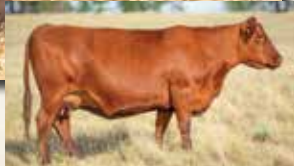
HRR STARLIGHT 633, DAM