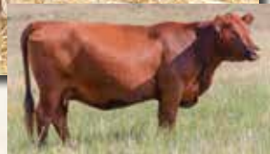
HRR ZEPPELIN 1254, DAM