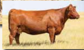
HRR JULIA 857, DAM

HRR Julia 4150 is another young heifer that had good performance and her dam, HRR Julia 857 posts a 101 MPPA.