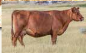
HRR BLOCKANA 2178A, MGD