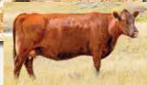
HRR COLLEEN 613, MGD