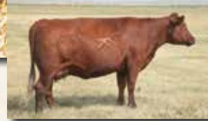
HRR MONA 428, MGD