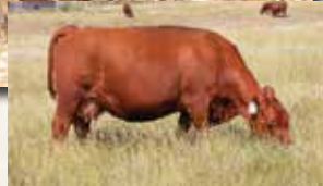
HRR JULIANN 9191, DAM