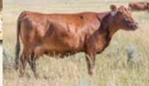
HRR THELMA 1101, MGD