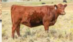
HRR COLLEEN 049, DAM