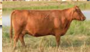
HRR COLLEEN 308, MGD