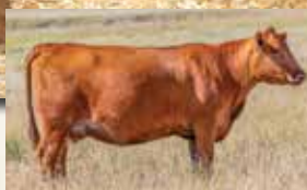
HRR BLOCKANA 097, DAM