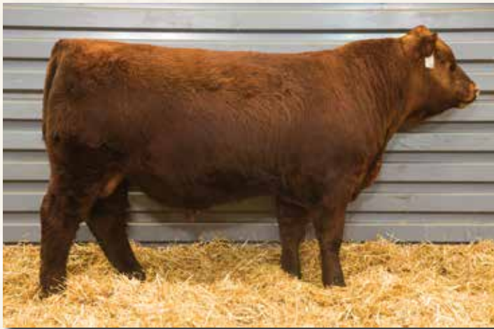
HRR FRANCHISE 8211