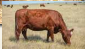
HRR MONA DIVA 797, DAM