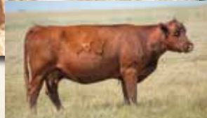
HRR ESTONIA 520, DAM