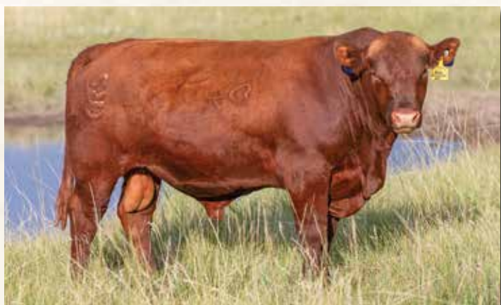
RIDGE AVALANCHE 2051

As you study this group of young cows there is not one that weaned off a below average weaning weight on their first calf. Our drought/hail conditions in the summer of 2024 put us in a position where we had to reduce the herd so here is a potential opportunity to tap into some really solid young cows. They were exposed to three bulls - Ridge Avalanche 2051, Ridge RIZZ 3089 and MLK Crk Ultra Cool 3214 until July 15th, then exposed to the additional clean up bulls when we turned them with the mature cows in the hills. We can provide whatever info/dna needed to identify the sires to the resulting calves. These cows were pregnancy tested by Dr. Bleaux Johnson, West River Veterinary Clinic on August 22nd to calve between March 20 and April 20, 2025.