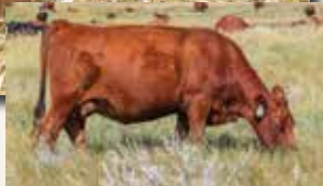
HRR ZINA 001, DAM