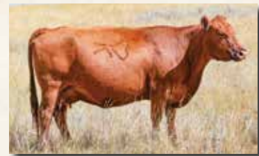
HRR ESTONIA 589, DAM

RIDGE COMPASS 7087 RIDGE NAVIGATOR 0039 RIDGE HOB0 016-9027