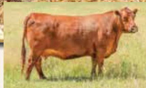
HRR BLOCKANA 013, DAM