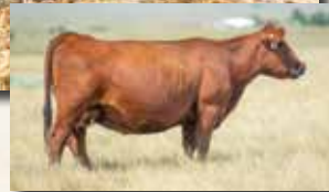
HRR FREYJA 804, DAM

This 5L Body Builder 4434-68D son did a nice job at the scale and his dam, HRR Freyja 804 is an attractive, long bodied female that comes from a good cow line. A solid performance bull.