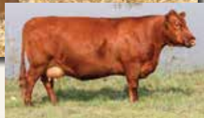
HRR BLOCKANA 013, DAM