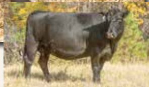
HRR MADAME PRIDE 688, DAM