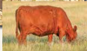
HRR LAKOTA 991, DAM