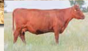
HRR LAKOTA 917, DAM