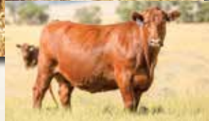
HRR MISSY 742, DAM