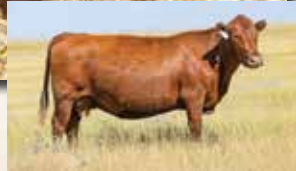
HRR GOLDI 745, DAM