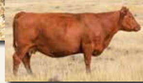
HRR LAKOTA 623, MGD