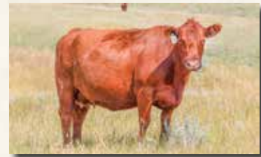
HRR LAKOTA 982, DAM

HRR Body Builder 4238 is a really complete 5L Body Builder 4434-68D son with low birth, good performance and a super disposition. His dam, HRR Lakota 982, is a favorite at Heart River Ranch because she gets it done without a lot of fanfare. This is her first bull with all of her daughters still in production. His maternal genes go back to HRR Lakota 699, HRR Lakota 430A, HRR Lakota 115 and MLK CRK Lakota 850, all top donor cows for Heart River Ranch. Keep the daughters on this bull as with time he should be a sire of really functional cows.