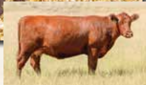
1MJM LEXI 904, DAM