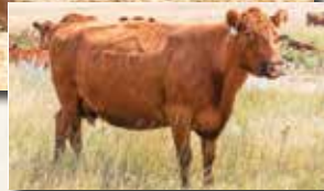
HRR BANA 002, MGD