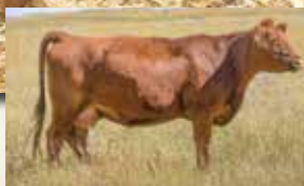
HRR MONA 068, DAM