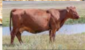
HRR BLOCKANA 867, DAM