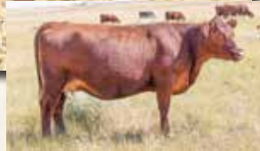
HRR ABBEY 080, DAM