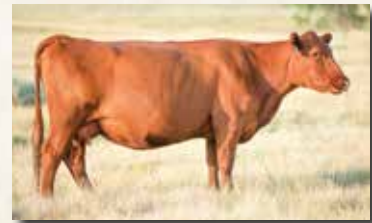
HRR BLOCKANA 741, DAM