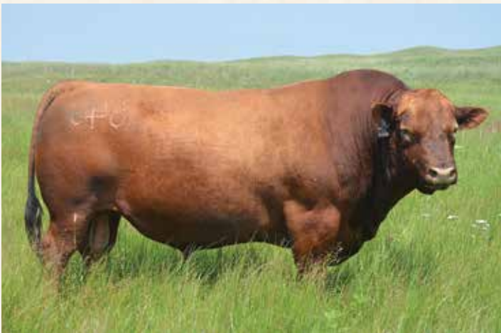
RED HILL B571 JULIAN 84S

EPDS and consistently sires dark red. Rockefeller had an injury that put him down at an early age. Semen is rare and these will be a limited sample of his sons for sale in 2025. 6 sons sell.