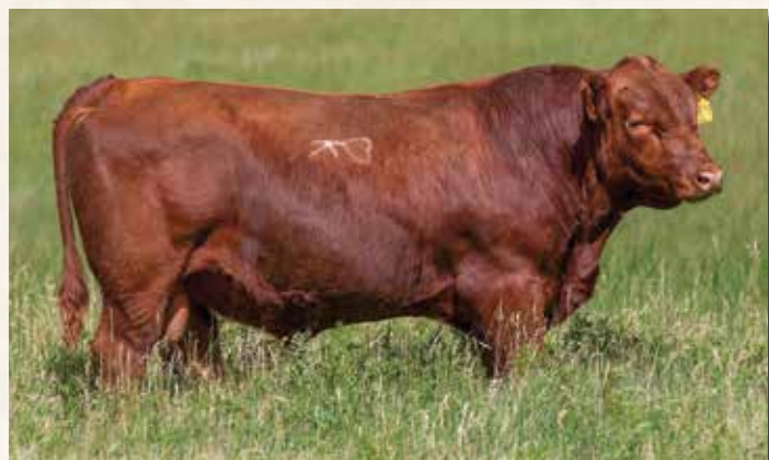
MLK CRK ULTRA KOOL 3214