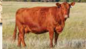
HRR FREYJA 651, MGD