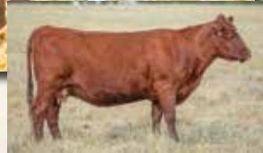
HRR INATEXI 533, MGD