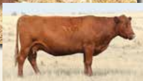
HRR INATEXI 568, DAM