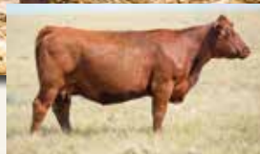
HRR MEG 9178, DAM