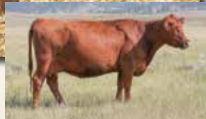
HRR FREYJA 905, DAM