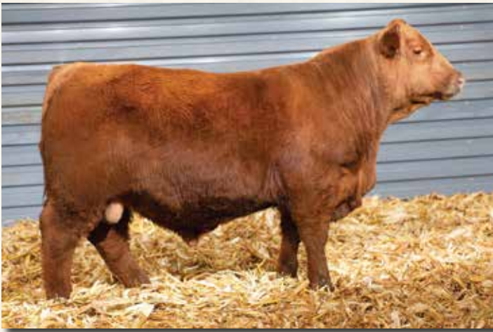
HRR COPENHAGEN 2265