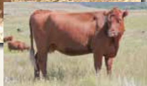
HRR LAKOTA 108, DAM