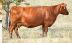
HRR BLOCKANA 548, DAM