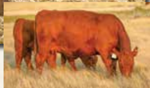
HRR MISSY 811, MGD