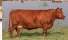
HRR BLOCKANA 013, DAM