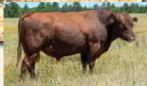
MLK CRK STEWARD 7334, SIRE