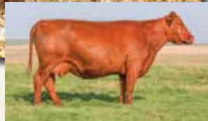
HRR LAKOTA 699, DAM