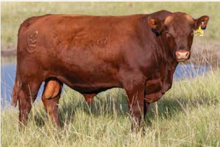
RIDGE AVALANCHE 2051

Ridge Dimension 1010 was one of our sale picks in 2022 from Sandbur Ridge Red Angus to continue the 5L BODY BUILDER 4434-68D line. He was a moderate birth but a top performing bull in their sale and he looks to be holding true to his record. He is easy going with a balanced EPD profile out of a proven 10-year-old dam, RIDGE CASEY 9071-4050 who has a 103 MPPA on 8 head. 4 sons sell.