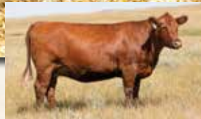
HRR FREYJA 959, DAM