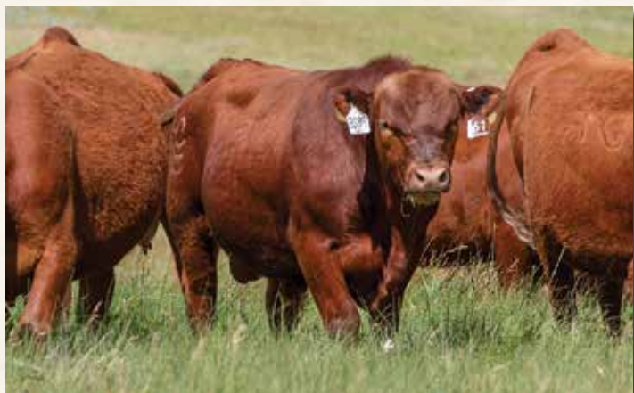
RIDGE RIZZ 3089