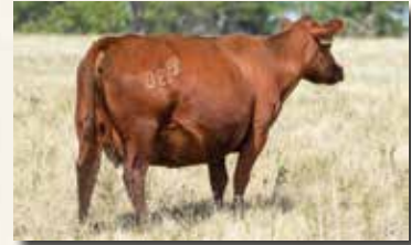
HRR LAKOTA 430A, MGD