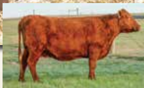
DAHLKE RED GIRL, MGGD