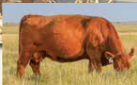
HRR MONA 773, DAM