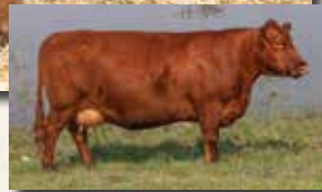
HRR BLOCKANA 013, DAM

HRR Blockana 439 is one of many ET daughters out of our prolific donor dam, HRR Blockana 013 and RED U-2 Authentic 139A. The daughters in production out of this mating are very good performance cows with sound feet and udders.