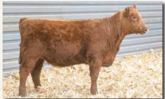
HRR COMMERCIAL HEIFER