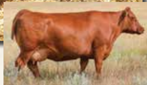
HRR LAKOTA 115, MGD