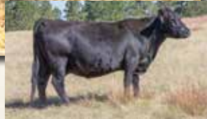
HRR PAULA 989, DAM