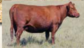
HRR FREYJA 416, DAM