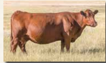
HRR BLOCKANA 566, MGD