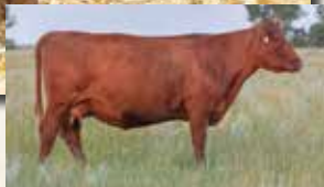
HRR LAKOTA 917, MGD