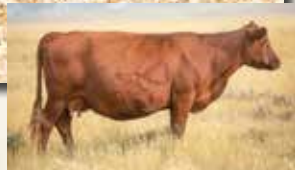
HRR FREYJA 448, DAM