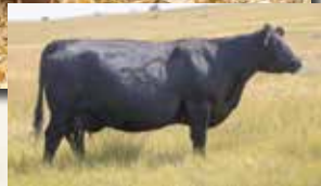
HRR LAKOTA 707, DAM