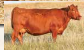
HRR SHEBA 926, DAM