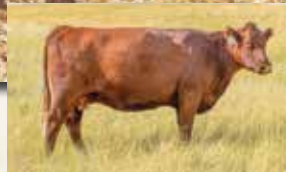
HRR ESTONIA 815, DAM