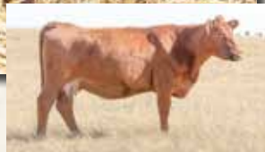
HRR LAKOTA 079, DAM