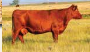
HRR BLOCKANA 847, DAM