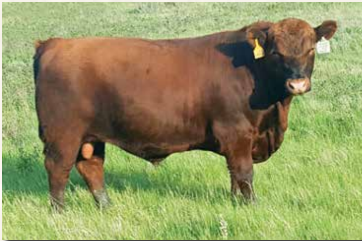
RIDGE RAD 9075