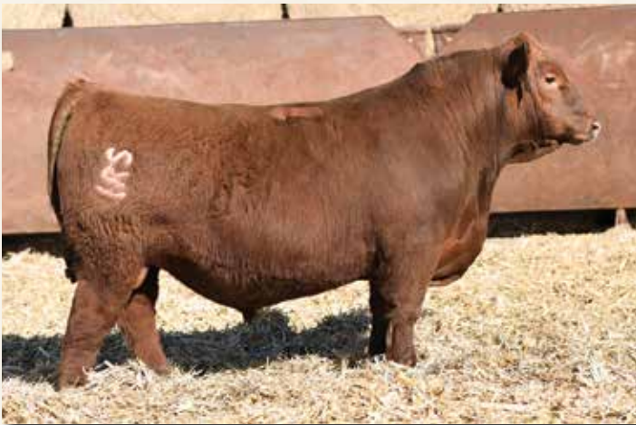
RIDGE DIMENSION 1010

HRR Copenhagen 2265 was a top seller in our 2022 sale. We will continue to use him based on what we see in his calves in several herds. His dam, RED Bar E-L-Bull Meg 985W came from the infamous Meg cow family from Bar EL in Canada was a moderate tank of a cow and his heifer calves look to follow suit. 4 sons sell.