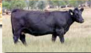
HRR PAULA 994, DAM