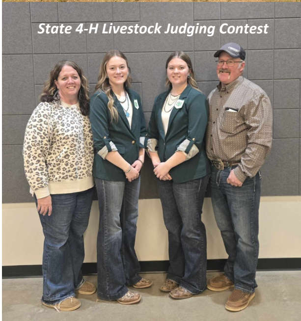
State 4-H Livestock Judging Contest