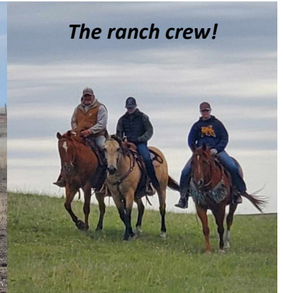
The ranch crew!