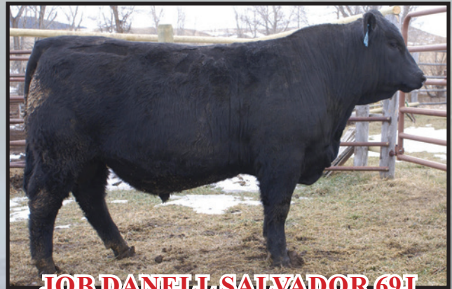
JOB DANELL SALVADOR 69J