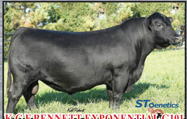
K C F BENNETT EXPONENTIAL G101