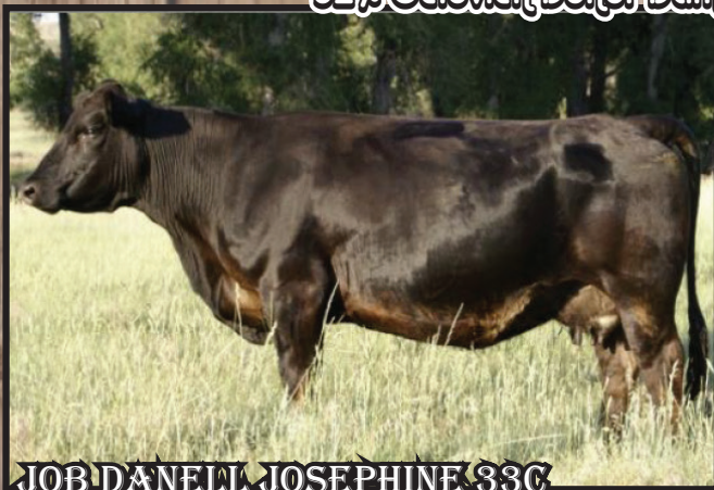
JOB DANELL JOSEPHINE 58C