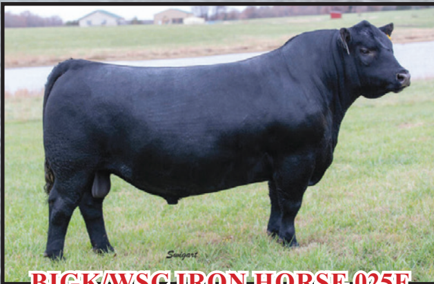
BIG K/WSC IRON HORSE 025F