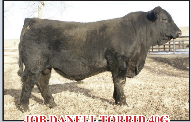
JOB DANELL TORRID 40G