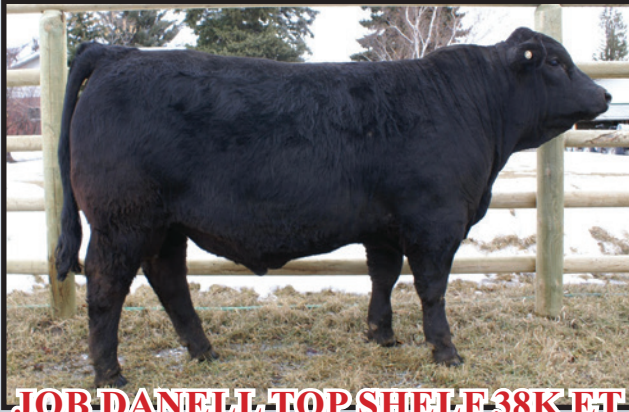
JOB DANELL TOP SHELF 38K ET