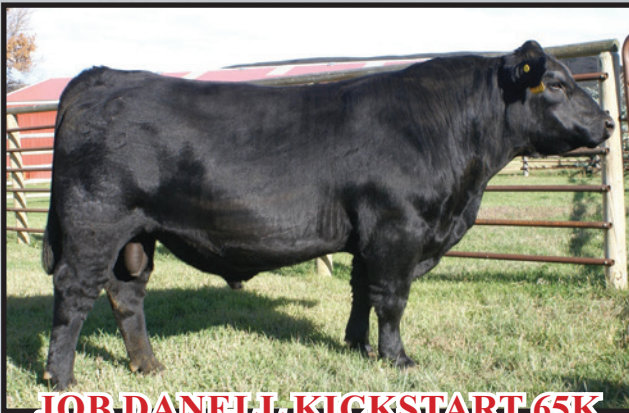
JOB DANELL KICKSTART 65K