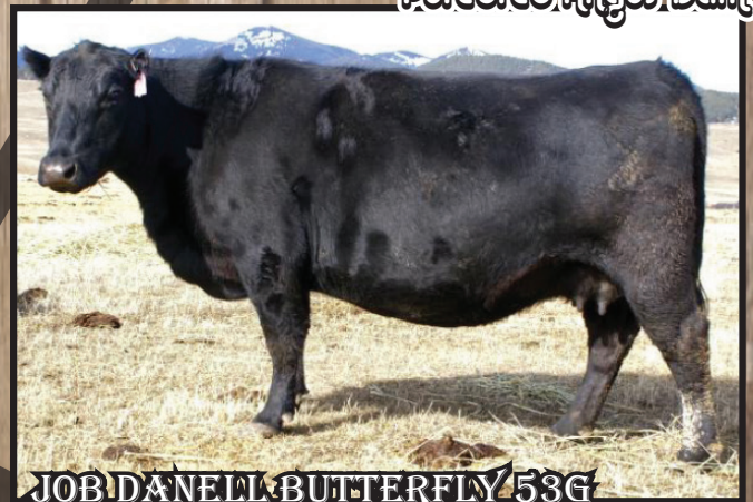
JOB DANELL BUTTERFLY 53G