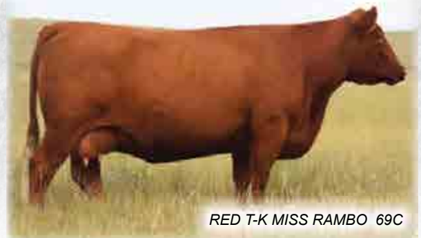
RED T-K MISS RAMBO 69C