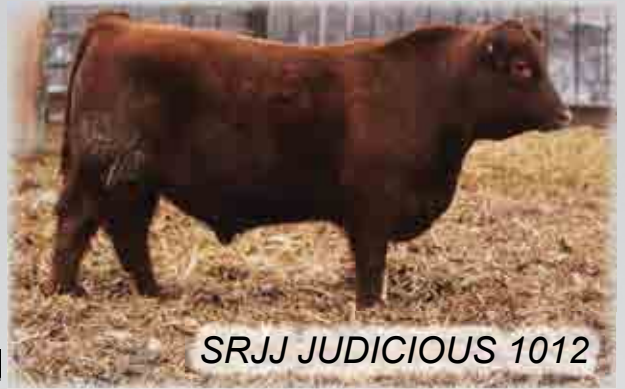
SRJJ JUDICIOUS 1012