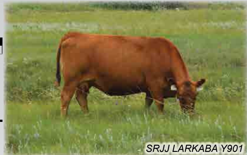
SRJJ LARKABA Y901