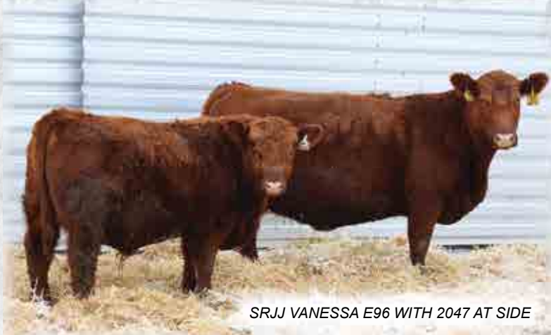
SRJJ VANESSA E96 WITH 2047 AT SIDE