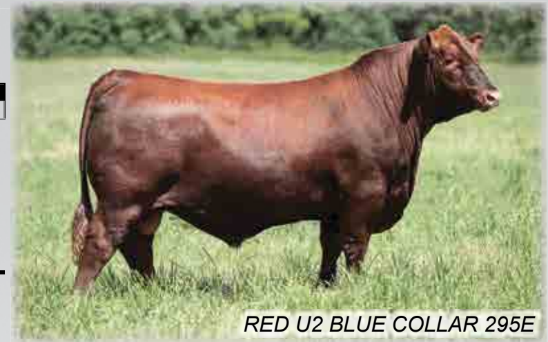
RED U2 BLUE COLLAR 295E