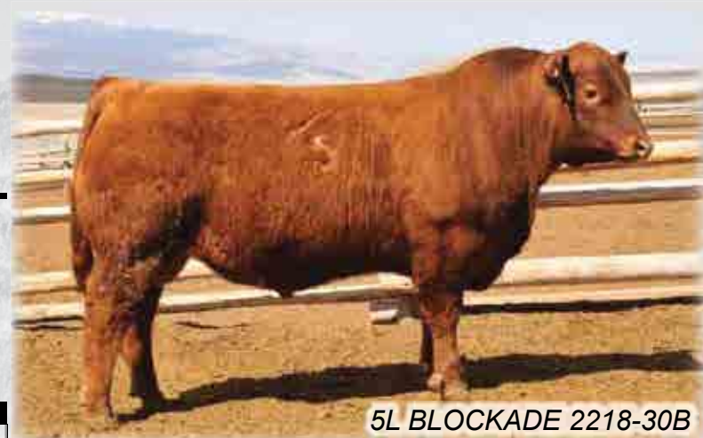
5L BLOCKADE 2218-30B