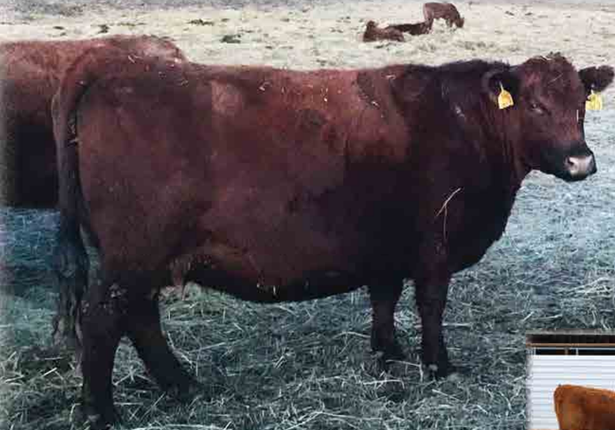
Princess E16 went to Larsen Vet with E96 to get flushed as well. We flushed E16 for her exceptional udder and added performance. She has a little more frame and her sons will add pounds to any calf crop.