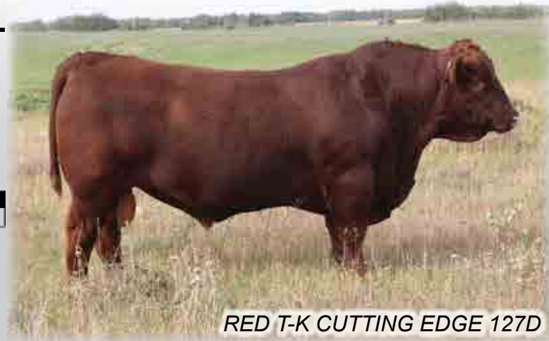
RED T-K CUTTING EDGE 127D