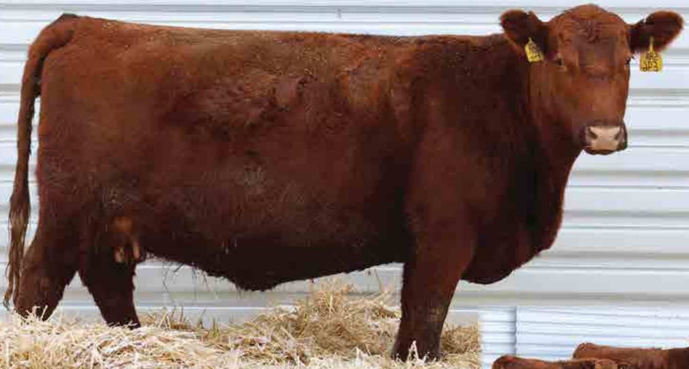
Vanessa E96 is a cow we chose to flush a couple of years ago. For a cow to get flushed at Sandhill Red Angus really means something. E96 earned her position. For the commercial cattleman looking for easy-keeping, heavy muscled, yet moderate cattle, she is the answer. E96 has many sons in this sale out of top bulls in the industry.