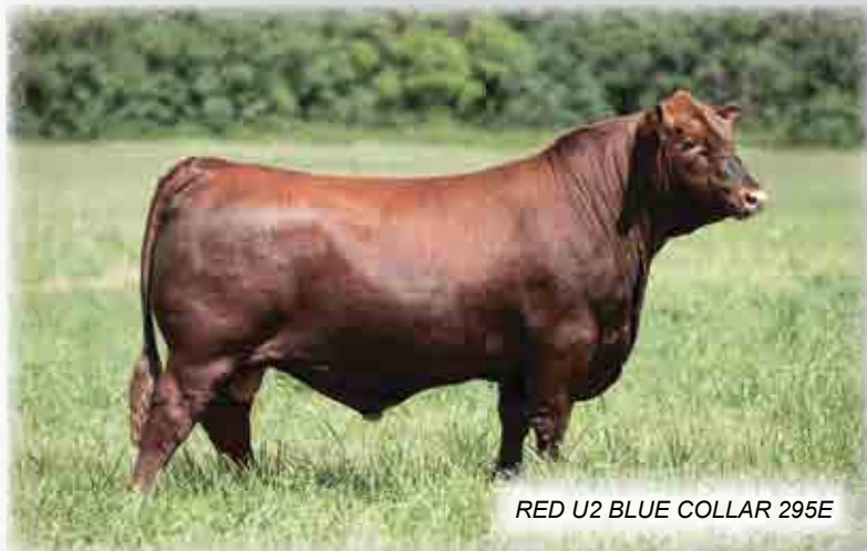
RED U2 BLUE COLLAR 295E