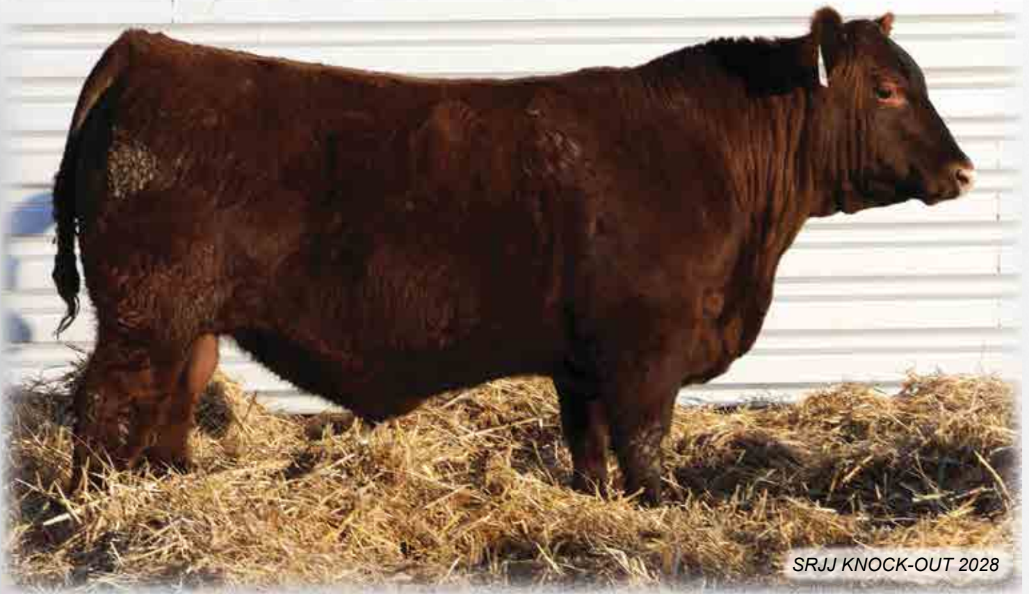
SRJJ KNOCK-OUT 2028