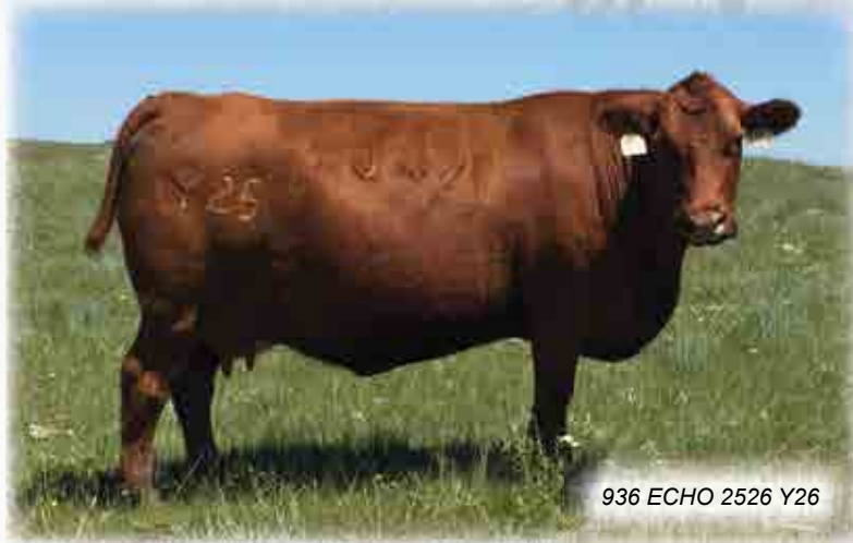
936 ECHO 2526 Y26