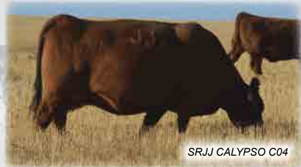
SRJJ CALYPSO C04