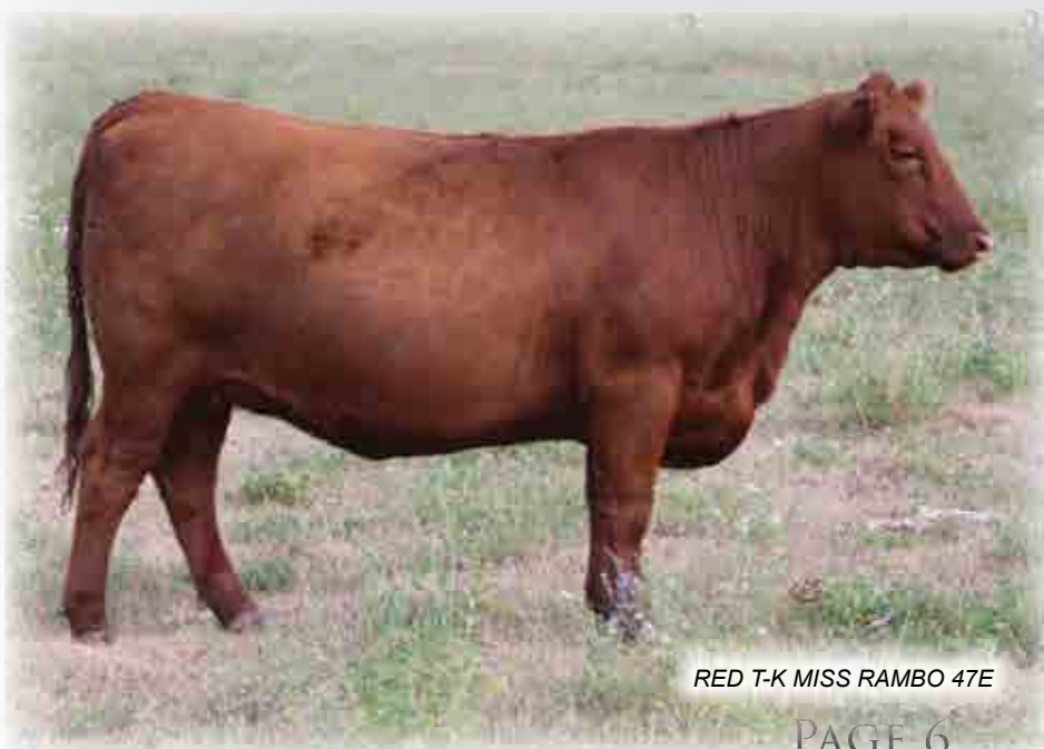
RED T-K MISS RAMBO 47E