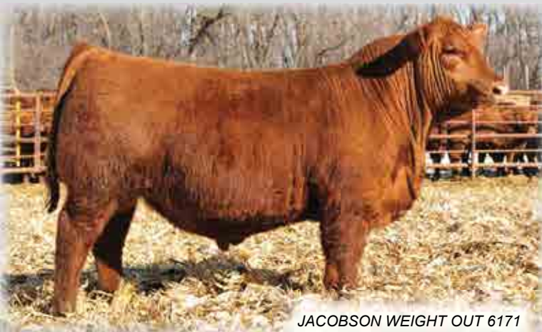
JACOBSON WEIGHT OUT 6171