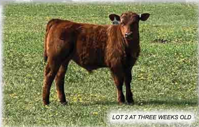
LOT 2 AT THREE WEEKS OLD

Royal is a powerfully built individual with unmatched muscle shape and dimension. It will be hard to find a heifer bull with as much red meat as 4072. Royal will make elite females that are made for the long haul. His daughters will also have unlimited mating options.