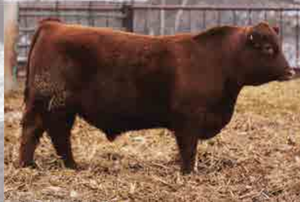
SRJJ KING 2016