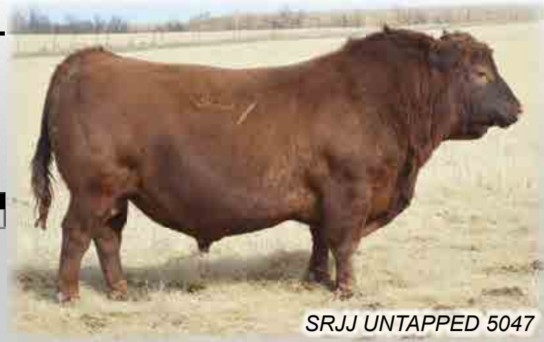
SRJJ UNTAPPED 5047