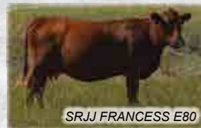
SRJJ FRANCES E80